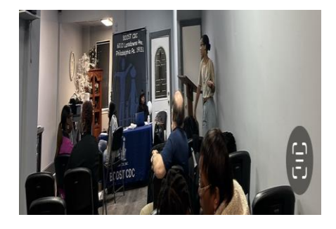
Addressing Impactful Community Needs